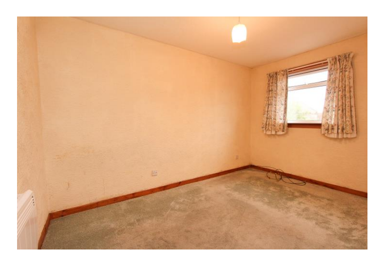
BEDROOM 3: A further bedroom to the front with built-in wardrobe and electric panel heater.