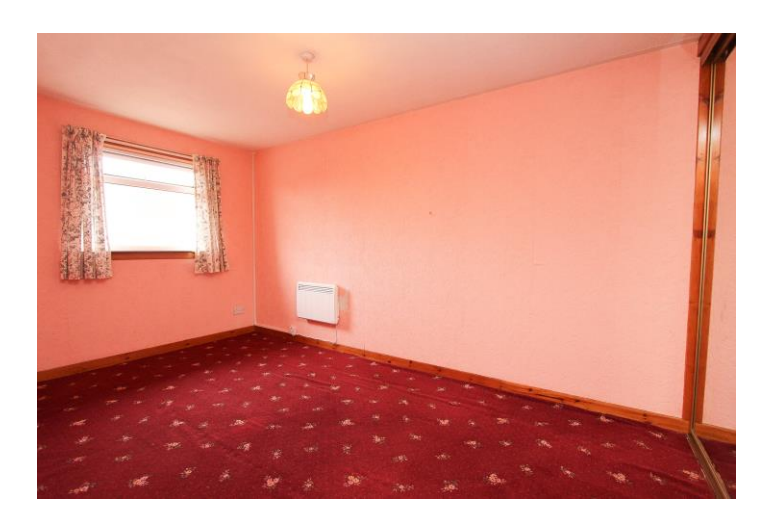
BEDROOM 2: A bedroom to the front with electric panel heater.

A bedroom to the front with built-in wardrobe and electric panel heater.